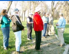
The Wednesday Watershed Walk Series was held at the Culver Conservancy on April 23rd, 2008